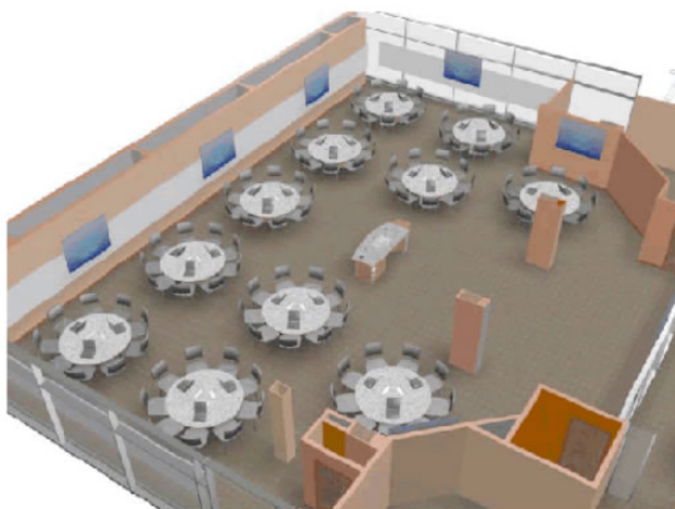
Figure 2. Classrooms at Pitt and MIT illustrate the common features of most SCALE-UP classrooms: 7' diameter round tables, whiteboards, projection screens, and one laptop/team. Photo courtesy of Adam Leibovich. Graphic courtesy of John Belcher.