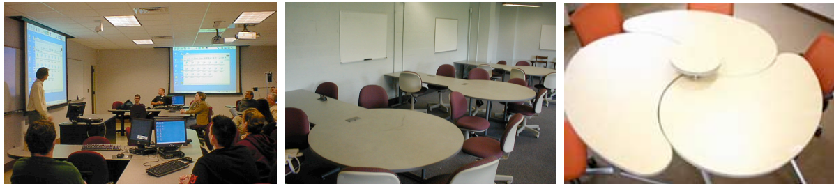
Figure 5: X and T-shaped tables at the University of Alabama, “Lollipop” tables at the University of New Hampshire, and “Bean” tables at the University of Tokyo.

researchers carefully examined various table shapes, eventually settling on round tables to best facilitate discussions. (In fact, four different diameters were classroom tested.) Several adopters have tried other table geometries. Alabama has X and T-shaped tables. New Hampshire has lollipop-shaped tables, but is now changing to rounds. Tokyo has “bean shaped” tables. It is interesting to note that Tokyo learned about SCALE-UP from the TEAL project at MIT. Georgia Southern, an institution that learned about SCALE-UP from Alabama, has rectangular tables. It would be useful to see why these changes were made and examine their impact on the learning environment.