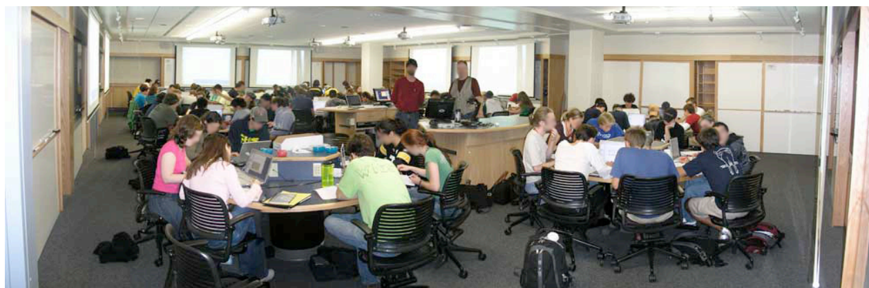
Figure 1. This photograph from Ithaca College shows the typical SCALE-UP environment: round tables seating three teams of three students, surrounded by screens, white boards and handy equipment storage. There is a teacher station located somewhere in the midst of the action. (Note that these tables are slightly smaller than usual.)

SCALE-UP 1 stands for “Student-Centered Active Learning Environment for Undergraduate Programs.” It describes a place where student teams are given interesting things to investigate while their instructor roams—asking questions, sending one team to help another, or asking why someone else got a different answer. Even in a science course, there is usually no need for a separate lab. Most of the “lectures” are class-wide discussions. The groups are carefully structured and give students many opportunities to interact with each other and the instructor. Three teams (labeled A, B, and C) sit at each round table and have white boards nearby. Every group has a laptop for searching the web. At NC State, the original site, classes usually have 11 tables of nine students. Most of the 50+ schools that have adopted the approach have smaller classes, while a few have even larger ones 2 . The majority of class time is spent on 10 or 15 minute “tangibles” and “ponderables.” Essentially these are hands-on activities, simulations, or interesting questions and problems. In science classes there are usually some longer, hypothesis-driven lab activities where students have to write detailed reports. Occasionally there will be lecturing, but that is mostly to provide motivation and a view of the “big picture,” which can be difficult for students to discern when they are not familiar with the entire course content.