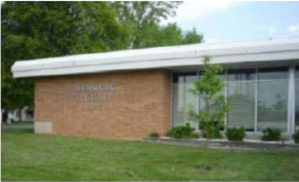
Adaptive reuse – Elementary School into Mayor’s Office and Courtrooms